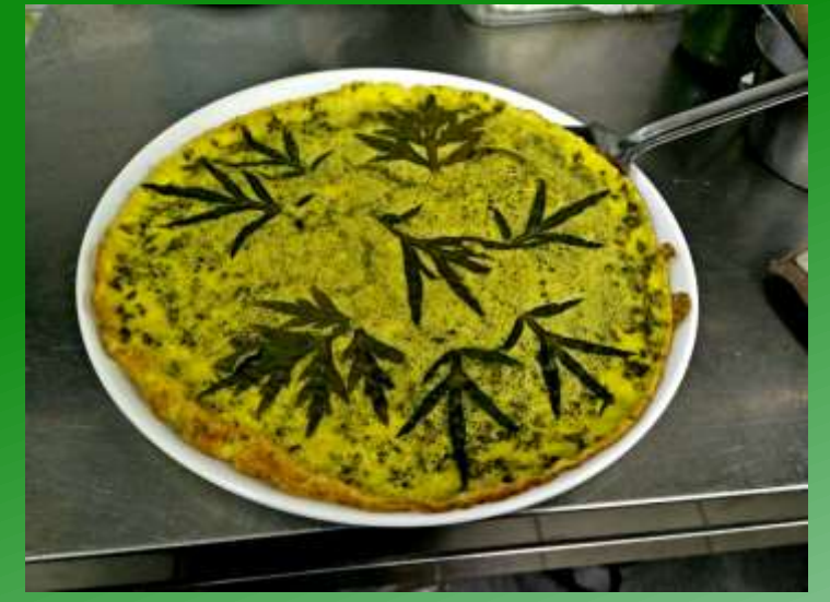
Omelette with Amaranth

Second courses: omelette with leaves of bear's garlic. ten asparagus recipe. hard boiled eggs with ten "asparagus": 1- wild asparagus, 2- black bryony, 3- butcher's broom, 4-amaranth, 5-old man's beard, 6-common hop, 7-goat's beard, 8-goat's beard asparagus, 9-pyrenees' star of Bethlehem, 10- field bindweed