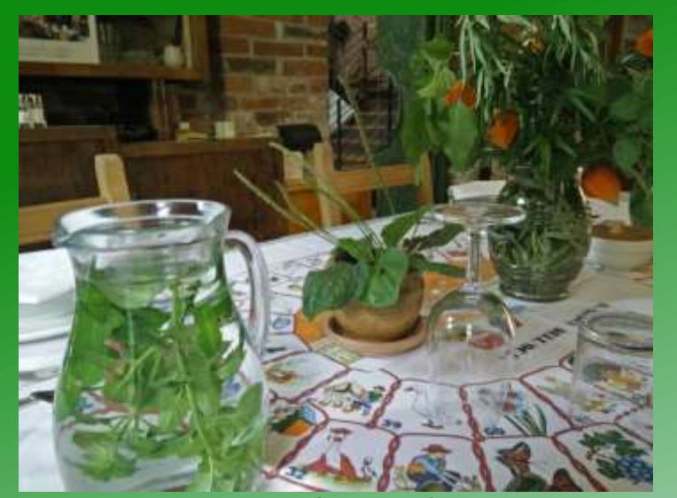
Water and mint leaves

Tasty Salad: with leaves of 1-lamb's lettuce, 2-garlic mustard, 3-common dandelion, 4-common mallow, 5-plantain, 6-flatweed, 7-wild lettuce, 8-beaked hawk's beard, 9-goat's beard, 10-borage, 11-shepherd's purse, 12-burdock, 13-rampion bellflower, 14-peppermint, and flowers of 15-daisy, 16-Judas's tree, 17-common sowthistle, 18-common chicory, and 19-some raw seed of pea. 20-garden sorrel and/or of 21-sorrel.