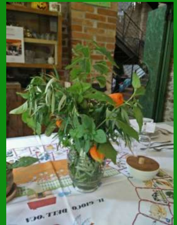
Decorating with herbs