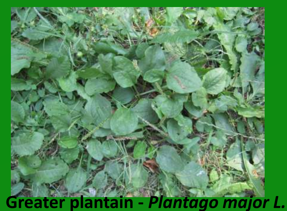
Borage - Borago officinalis L.