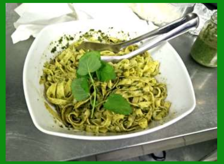
Fettuccine with fresh lemon balm leaves

First courses: little daisy soup. spaghetti with garlic, oil, and laurel. ravioli with ricotta cheese and common nettle. risotto with borage leaves. fettuccine with fresh lemon balm leaves.