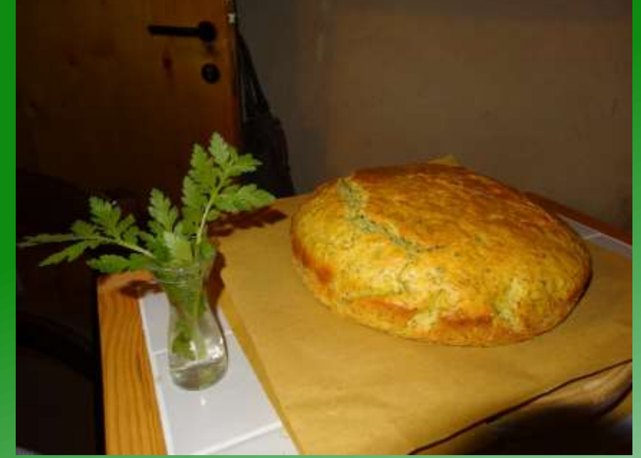
A cake with Tanacetum parthenium

Herbal tea: with hawthorn flower, laurel or strawberry leaves, mint leaves, elder flowers, hops or borage leaves, rosemary leaves, bermuda grass roots.