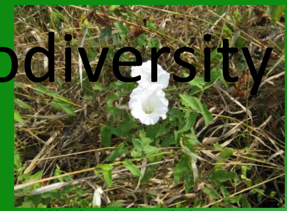
Field bindweed - Convolvolus arvensis L