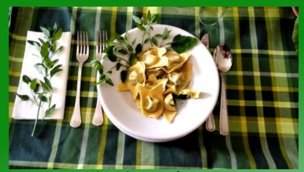
Ravioli with Goosefoot

First courses: little daisy soup. spaghetti with garlic, oil, and laurel. ravioli with ricotta cheese and common nettle. risotto with borage leaves. fettuccine with fresh lemon balm leaves.