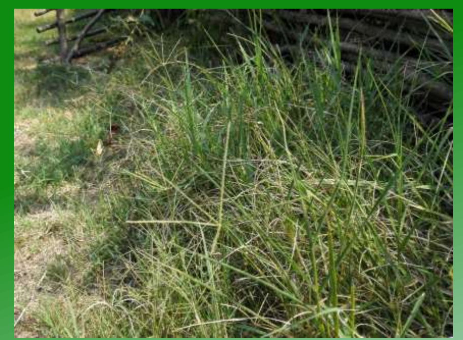
Bermuda grass – Cynodon dactylus L.