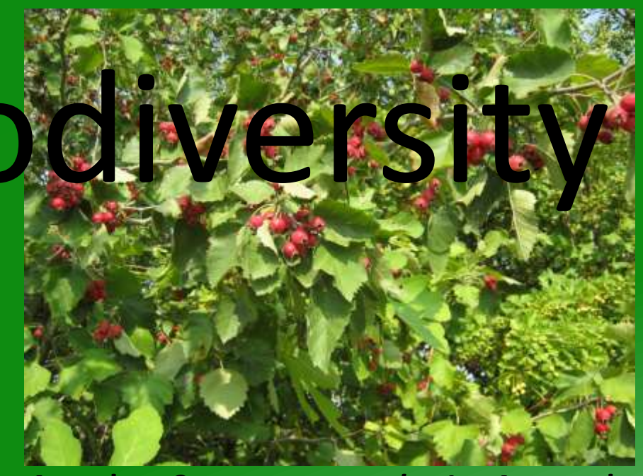
Azarole – Crataegus azarolus L. - Azzeruolo