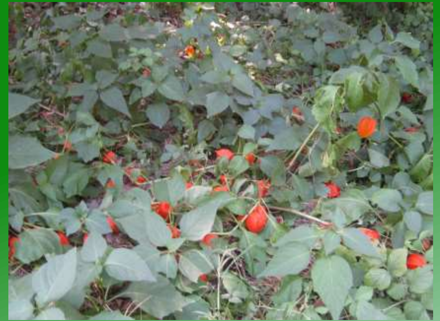
Chinese lantern- Physalis alkekengi L.