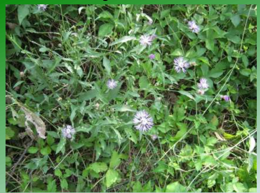
Brownray knapweed - Centaurea jacea L.